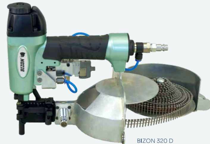
BIZON 320 D with „Jumbo” magazine

BIZON 903 DC coil nails length: 45 - 90 mm diameter: 2,5 - 3,4 mm head diameter up to 7,5 mm weight: 3,7 kg operating pressure : 5,5 - 8 bar